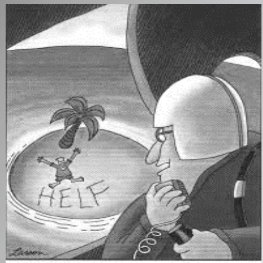
Wait! Wait! Cancel that. ... I guess it says 'helf.'

Write a short article (150-350 words) on any topic that interests you!